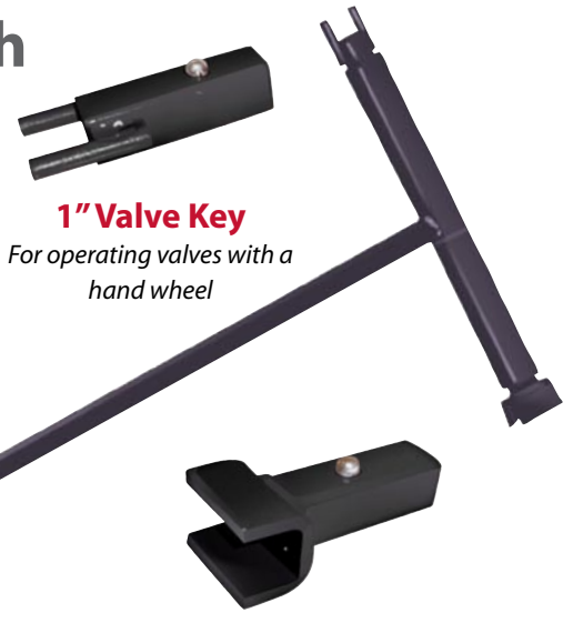
1" Valve Key For operating valves with a hand wheel