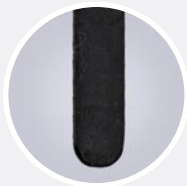
Round Edge Non-Tapered