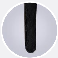
Round Edge Tapered *