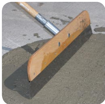
Long handled "troweling" action, too...

See handle options on page 66 - use #SP20215 (wood) or aluminum powder-coated handle.