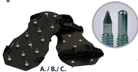
A. / B. / C.

All spiked shoes come with a durable snap-lock buckle system