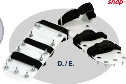
D. / E.