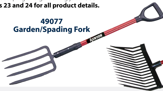
49077 Garden/Spading Fork