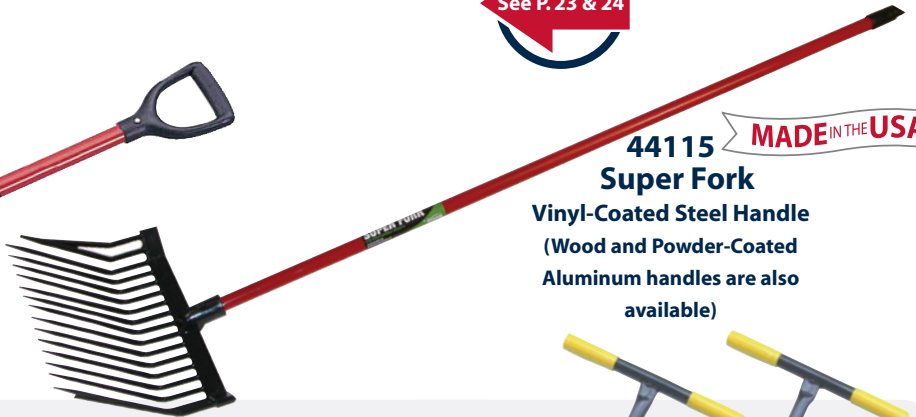
44115 MADE IN THE USA Super Fork Vinyl-Coated Steel Handle (Wood and Powder-Coated Aluminum handles are also available)

ProPlanter This professional-grade landscape tool is a back saver! It is designed to greatly reduce the time and effort spent in planting tray-style annuals and bedding plants in large commercial and recreational bedding areas requiring mass plantings. Made of powder-coated steel construction, the ProPlanter comes in the three-prong (6" on center) and one-prong designs.