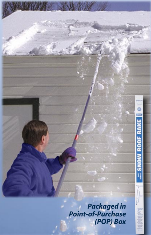
Packaged in Point-of-Purchase (POP) Box