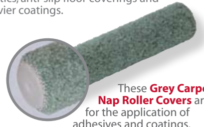
These Grey Carpet Nap Roller Covers are for the application of adhesives and coatings.