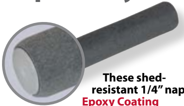
These shed-resistant 1/4" nap Epoxy Roller Covers exhibit great pick up, release and even flow capabilities. This cover resists both matting and drag. The extra thick polypropylene core resists water, solvents and cracking.