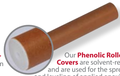
Our Phenolic Roller Covers are solvent-resistant and are used for the spreading and leveling of applied epoxies and mastics, anti-slip floor coverings and heavier coatings.