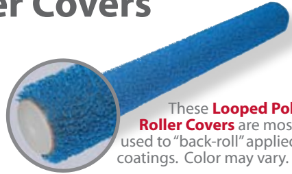
These Looped Polymer Roller Covers are most often used to "back-roll" applied coatings. Color may vary.